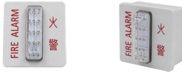
Ceiling / Wall Mount (White) – LED red flashing fire strobe light