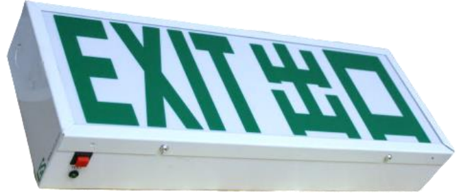
"Golden Star " ES-2P-01 (Single Side)